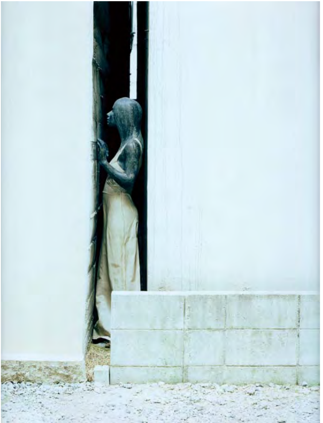
1030x1456mm digital print, cement, hemp cloth