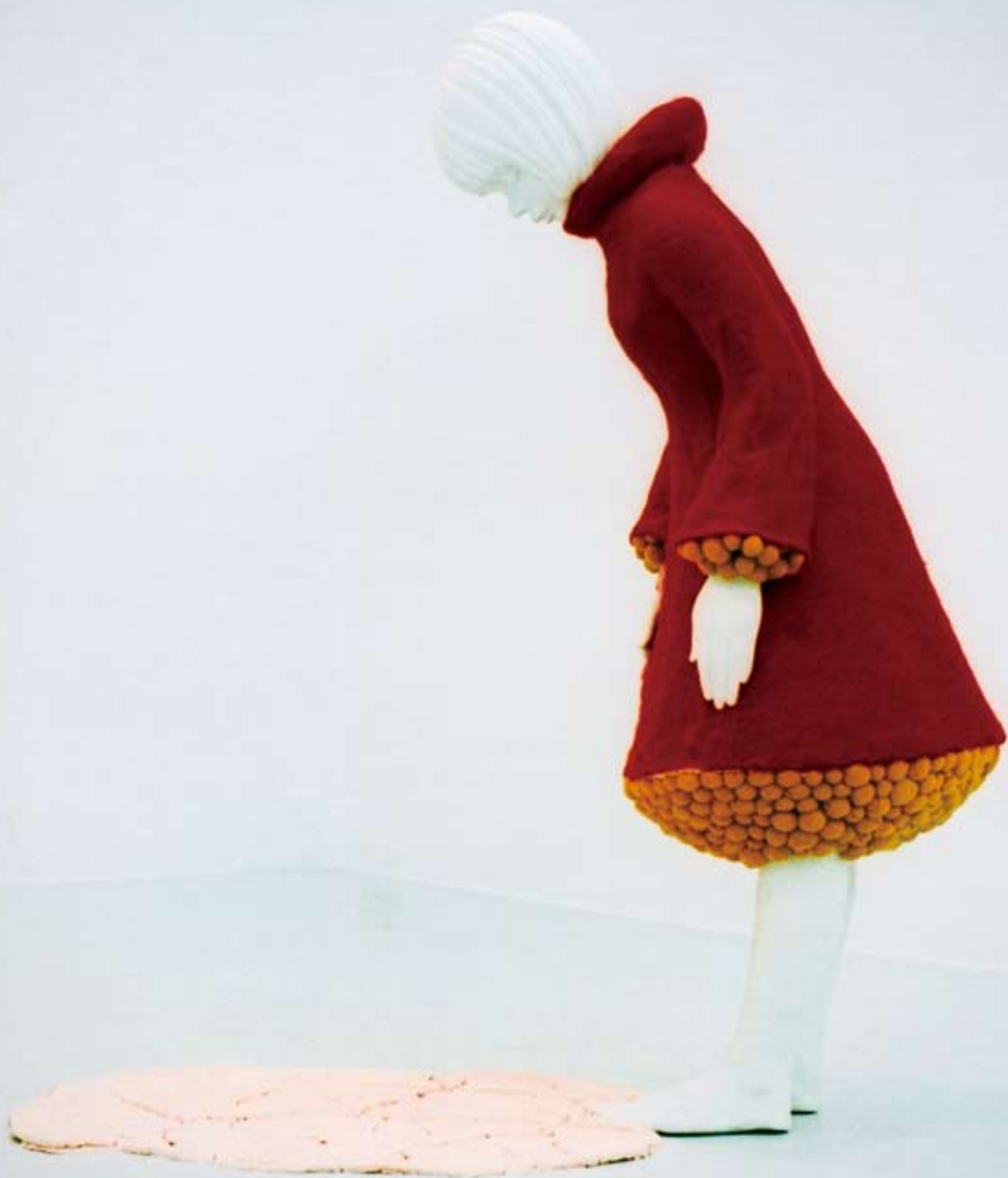
2006, Kyoto porcelain, felt, flour