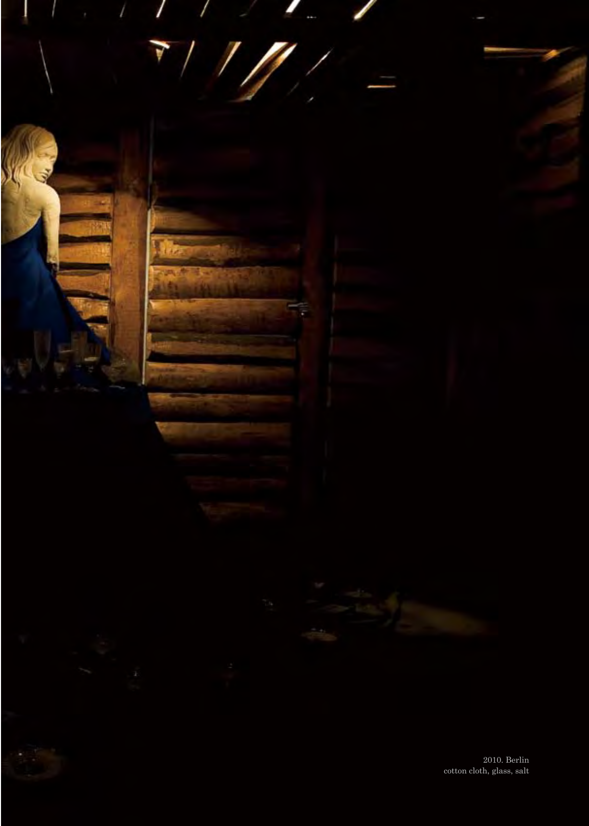
2010. Berlin cotton cloth, glass, salt