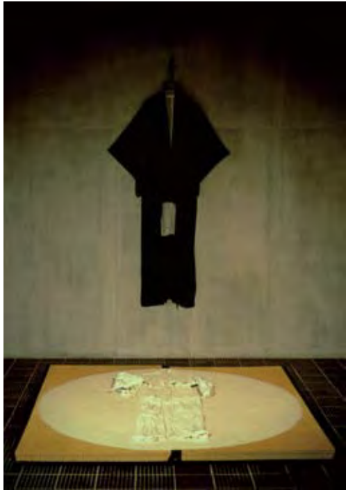
2005, Nagoya porcelain, Japanese mourning dress, sand, tatami